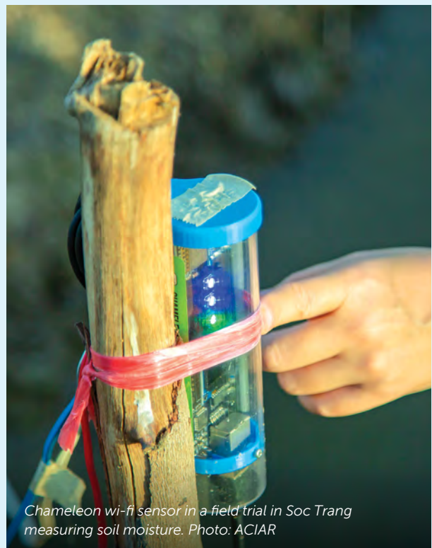
Chameleon wi-fi sensor in a field trial in Soc Trang measuring soil moisture.

Local DARD staff are excited to use the Chameleons to help train farmers to grow upland crops with the use of mulches and efficient irrigation practices. The FOCUS project field trials have demonstrated that with improved practices, profitable crops can be grown in the dry season, diversifying farm income and providing farmers with options as they continue to face the challenges of climate change.