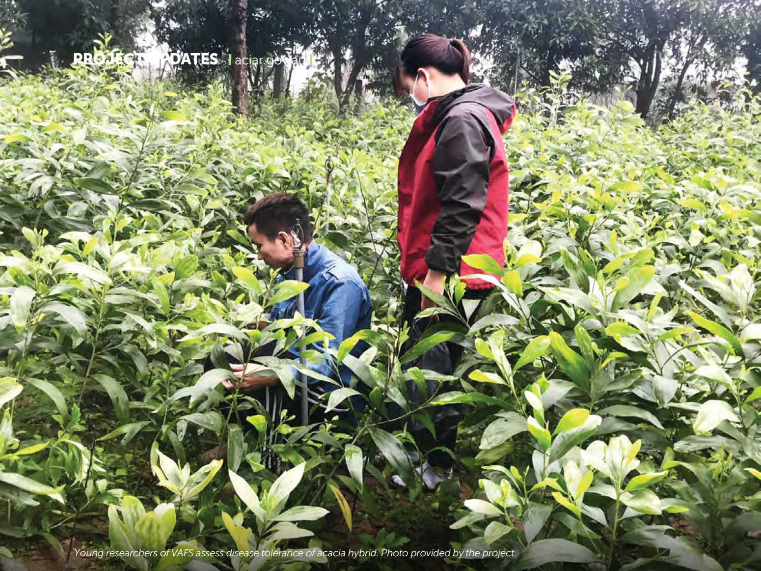
Young researchers of VAFS assess disease tolerance of acacia hybrid.