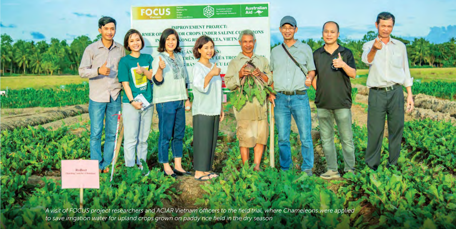
A visit of FOCUS project researchers and ACIAR Vietnam officers to the field trial, where Chameleons were applied to save irrigation water for upland crops grown on paddy rice field in the dry season

efficiency, the amount of product grown for each litre of water used and allow farmers to maximise the use of precious water resources throughout the dry season.