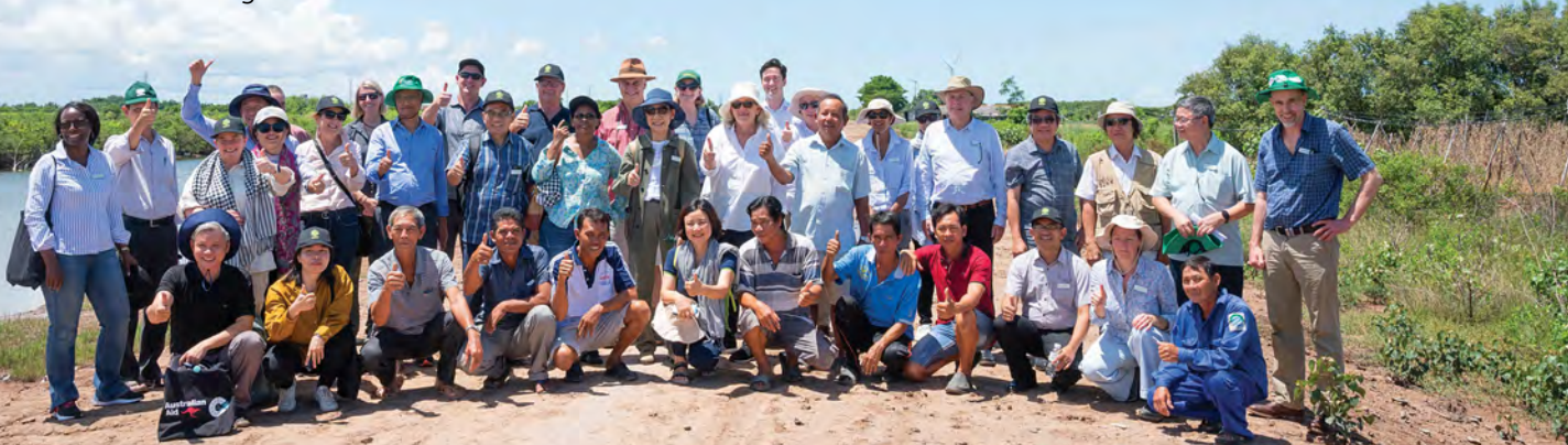
The Commission for International Agricultural Research and the Policy Advisory Council met with farmers in the Mekong Delta.

Based on our observations in the Mekong Delta and given the scale and urgency of the threats to global food systems, the Commission and Policy Advisory Council hosted a Food Systems Dialogue in Brisbane on 1 November 2022. The aim was not to dwell on the scale and nature of the problems, but to focus on transformative food system options that need urgent global support through international research and development collaboration.