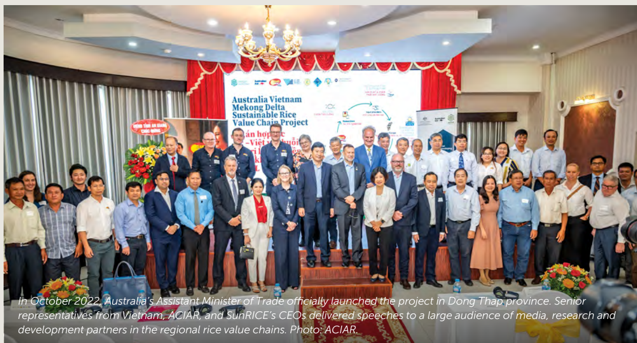
In October 2022, Australia's Assistant Minister of Trade officially launched the project in Dong Thap province. Senior representatives from Vietnam, ACIAR, and SunRICE's CEOs delivered speeches to a large audience of media, research and development partners in the regional rice value chains.

agribusiness company, SunRice Limited, aiming to establish a highly productive, sustainable, traceable, quality-assured value chain for export rice in the Mekong Delta, benefiting rice-farming households and meeting the market requirements of SunRice's established global customers. The project aligns with the Vietnamese resolution and development policy, encouraging a reduction in total rice production and a focus on production of high-quality rice with the aim to export to premium markets.