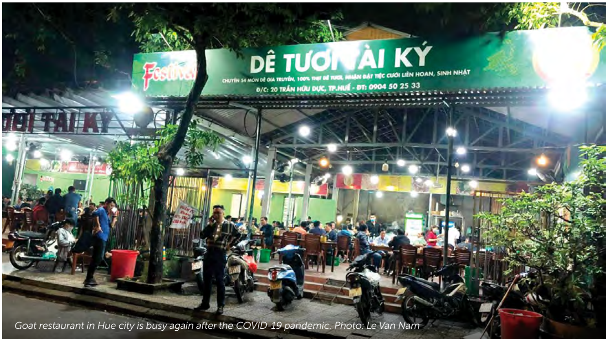
Goat restaurant in Hue city is busy again after the COVID-19 pandemic.

goats to restaurants in each province. Local traders select the goat supply based on the demand of goat meat restaurants. Three main goat supply sources are: