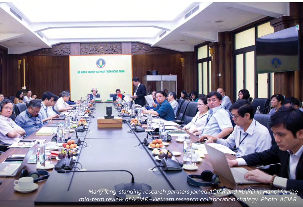
Many long-standing research partners joined ACIAR and MARD in Hanoi for the mid-term review of ACIAR–Vietnam research collaboration strategy.