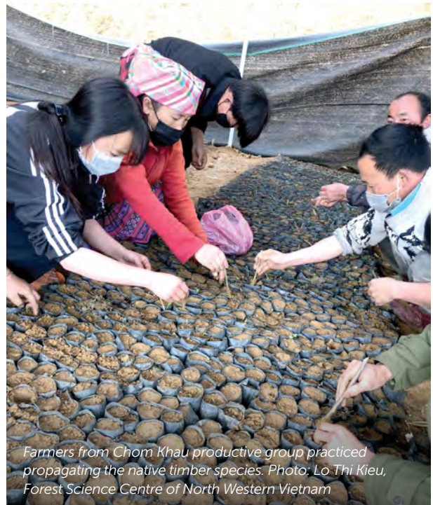
Farmers from Chom Khau productive group practiced propagating the native timber species.

Based on the information obtained from the commune officials about the result of production group, the leaders of the two communes made a change to the forest and agricultural development policy of the commune, paying greater attention to the development of indigenous trees and fruit trees for improving the local's livelihood.