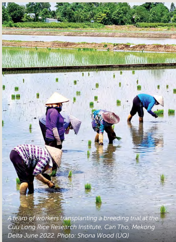
A team of workers transplanting a breeding trial at the Cúu Long Rice Research Institute, Can Tho, Mekong Delta June 2022.

The project will instil quality driven goals throughout the value chain, from land preparation through to finished product, driving improved outcomes for all parties, particularly smallholders and their communities and the environment, so that sustainable production systems and value chain relationships will be maintained after the completion of the project.