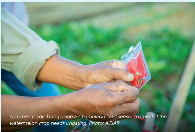
A farmer at Soc Trang using a Chameleon card sensor to check if the watermelon crop needs irrigating.