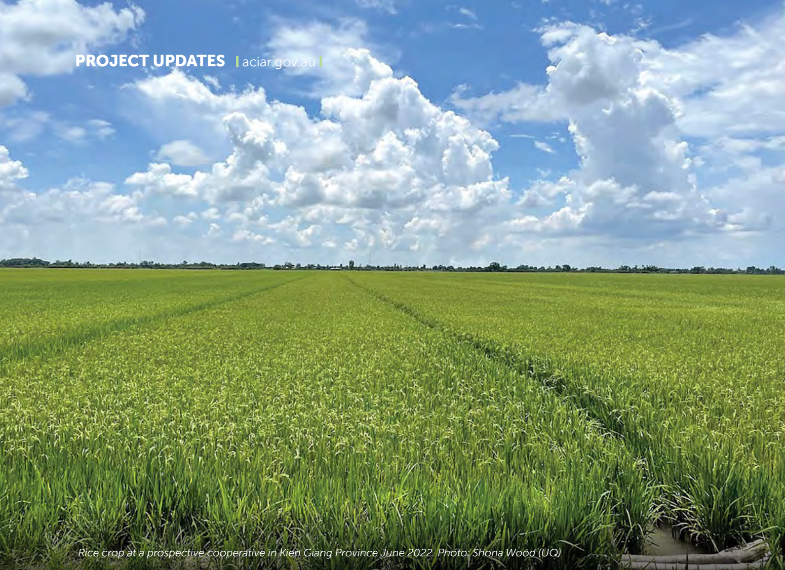
Rice crop at a prospective cooperative in Kien Giang Province June 2022.